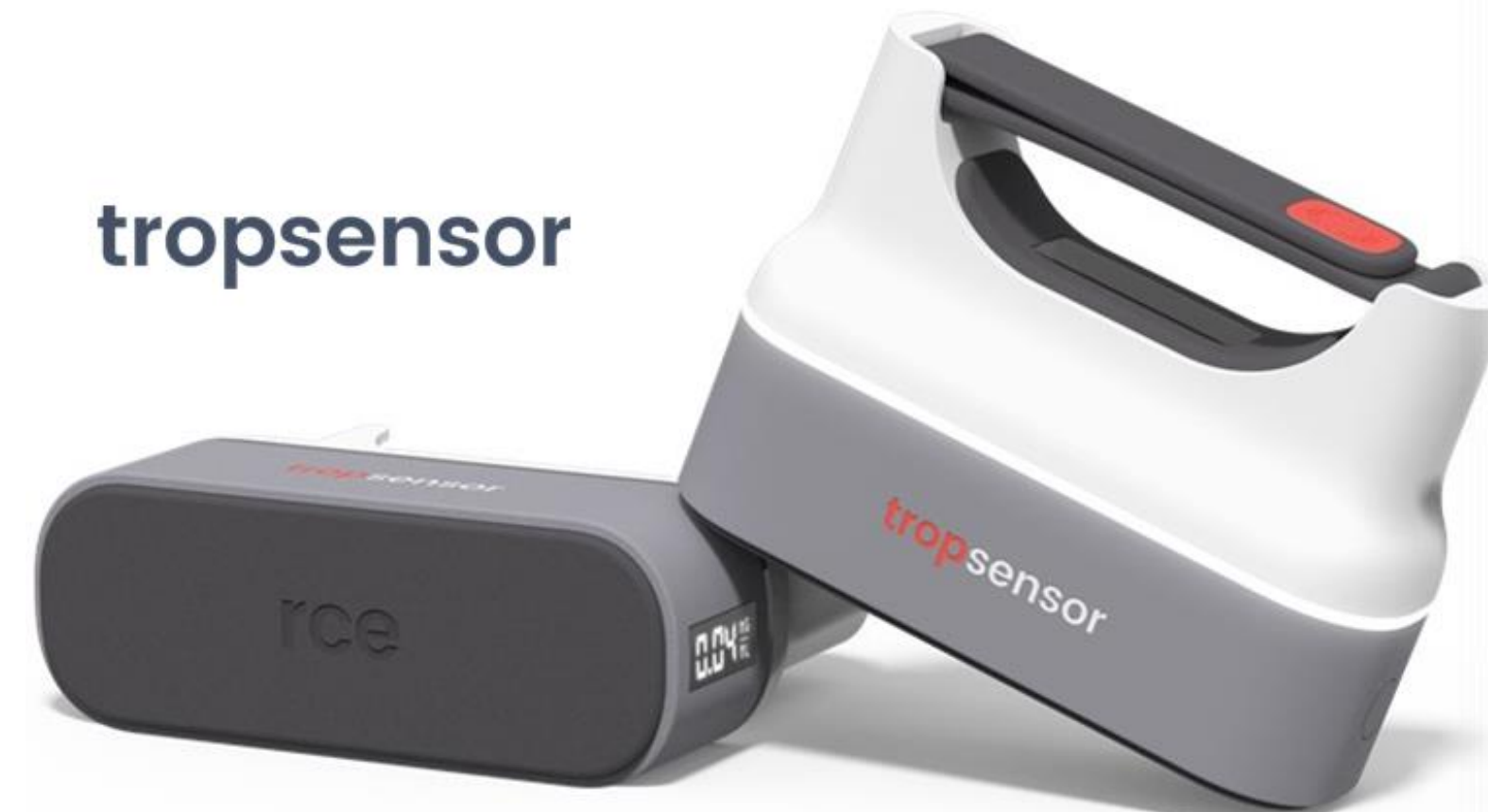
Figure 1. Tropsensor

Suspected acute coronary syndrome is a common Emergency Department presentation. A rapid transcutaneous troponin measurement would provide improved efficiency in acuity assessment and prevent ED overcrowding. Our purpose was to evaluate a non-invasive wireless wrist-worn optical wearable device for the rapid determination of cardiac injury. This technology is based on molecular spectroscopy that uses innocuous infrared light to detect changes in molecular absorption signals correlating with cardiac injury, even in a complex matrix such as skin and tissue.