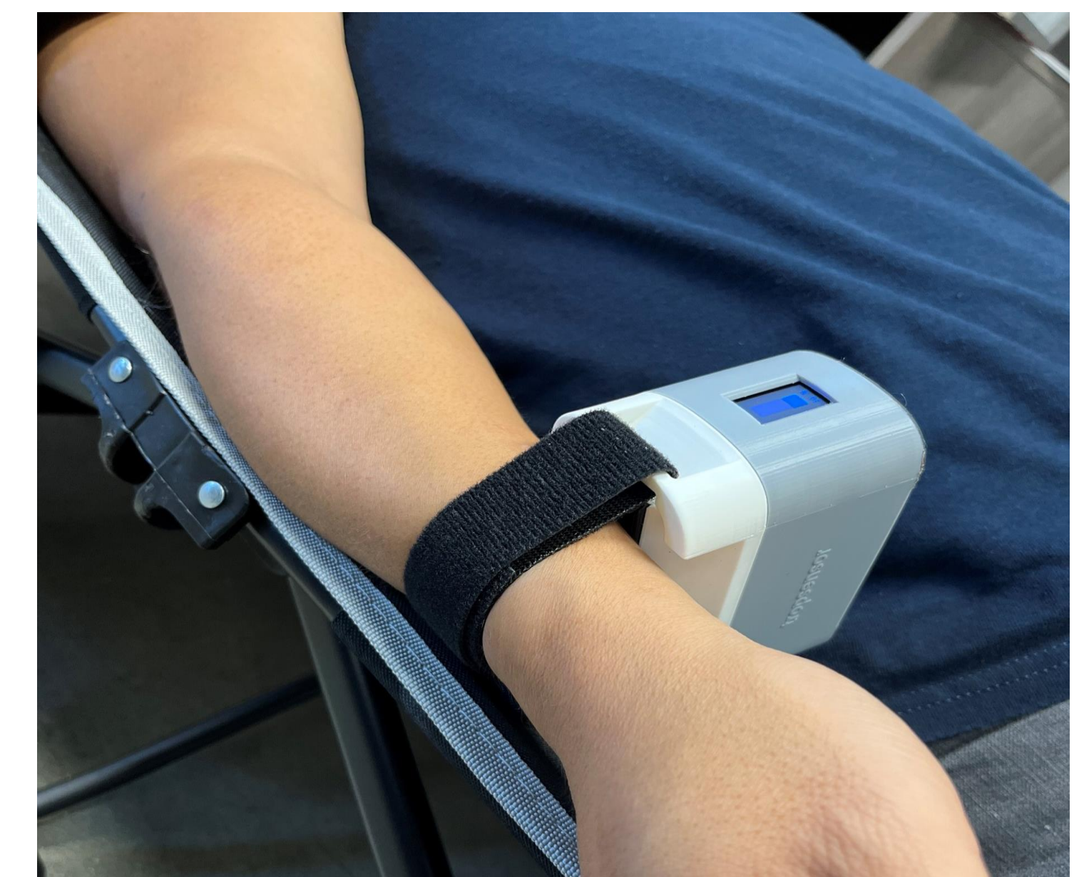
Figure 2. Tropsensor on a patient

The optical device delineated the patients with elevated cardiac injury biomarker from the normal subjects with an accuracy of 0.955 (CI: 0.949 - 0.96) and C-statistic of 0.96 (CI: 0.9461 - 0.9897).